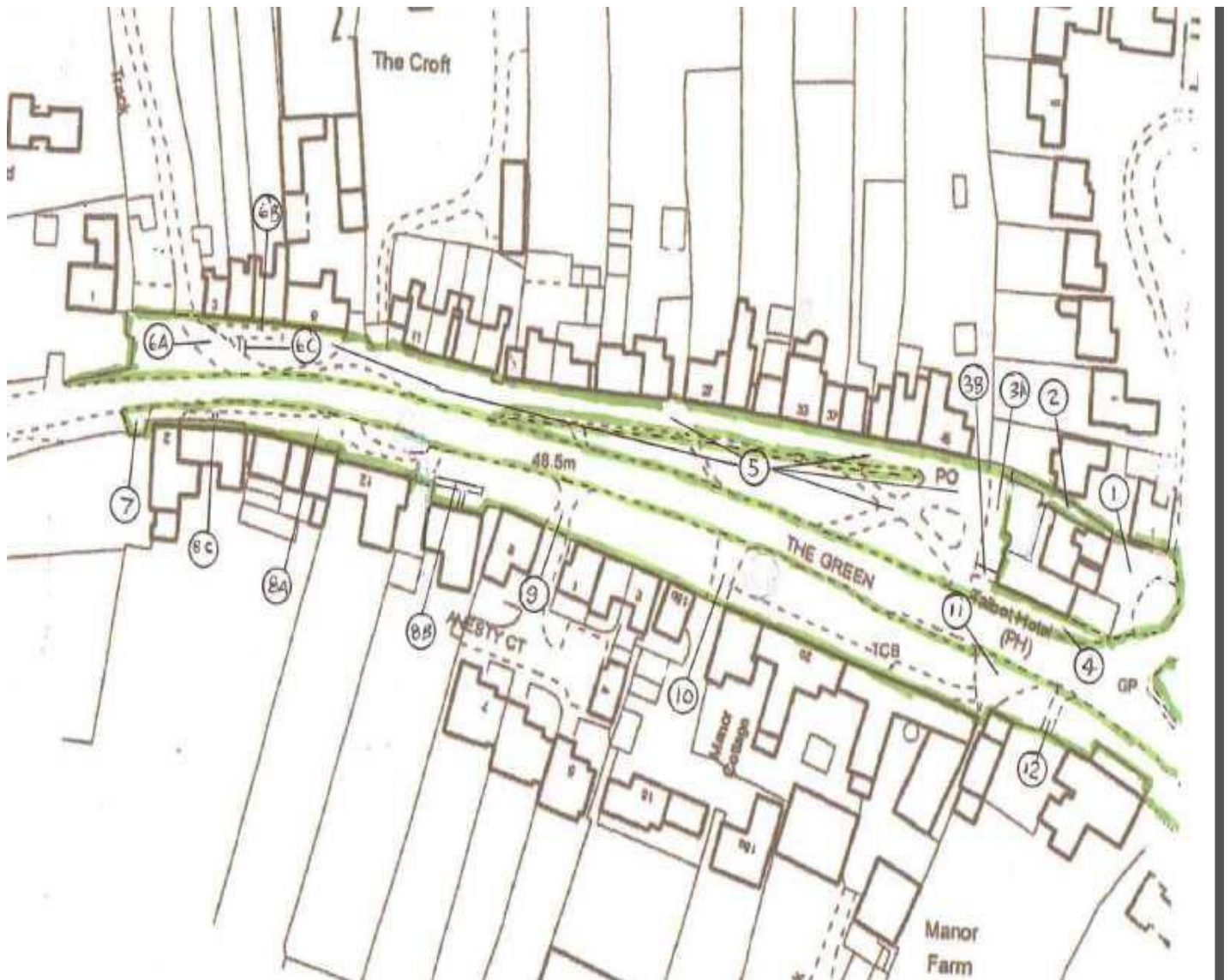
Maps showing Hard Surfaces forming part of the Village Green [for key see page 7]